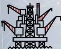
Oil & Gas